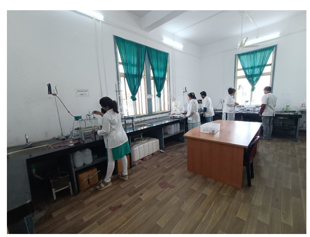
Post Graduate Lab