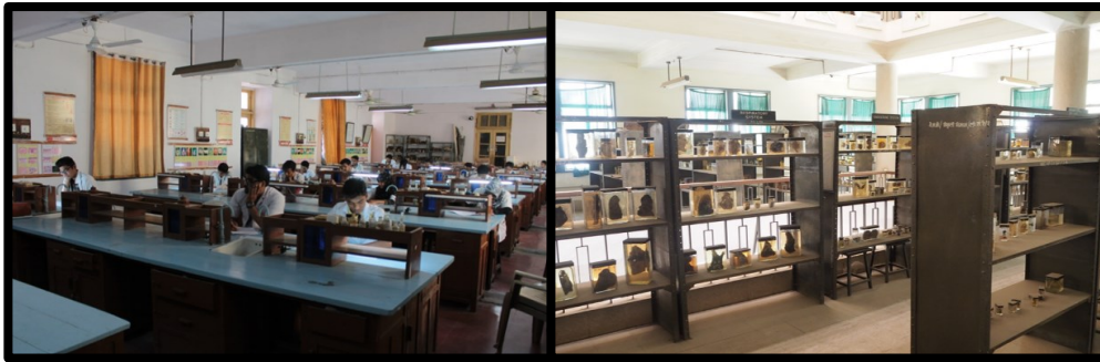
PATHOLOGY PRACTICAL HALL & MUSEUM