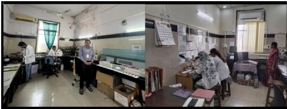
CENTRAL CLINICAL LABORATORY