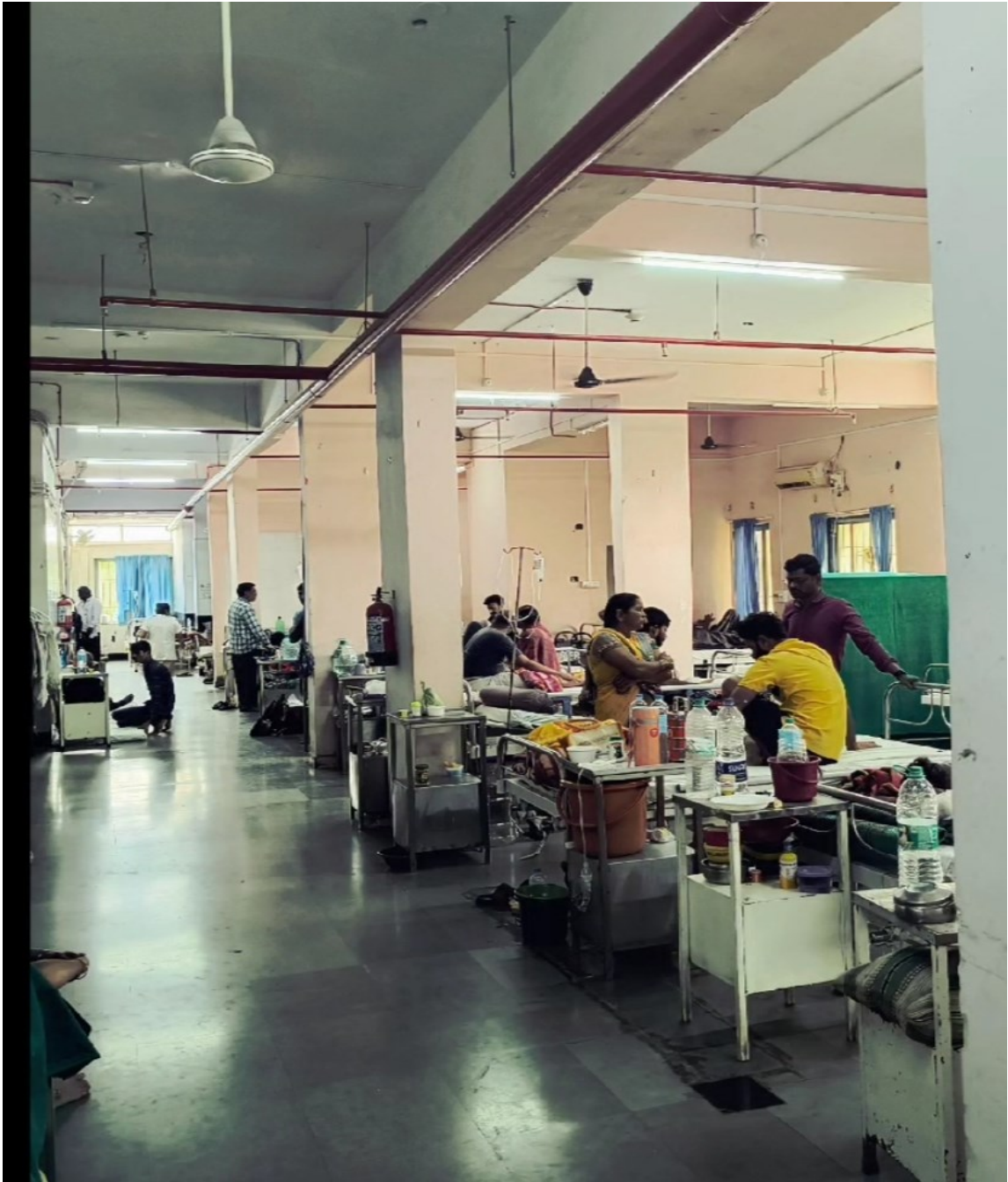
Orthopaedics IPD Ward