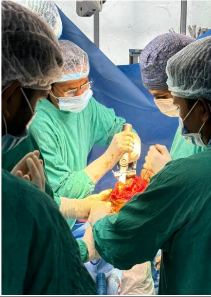
Joint replacement Surgery