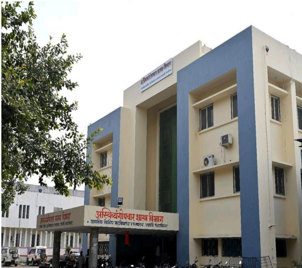
Separate Departmental Building