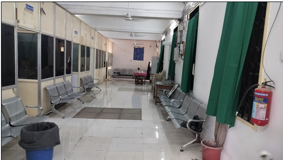
ENT OPD- PATIENT WAITING AREA