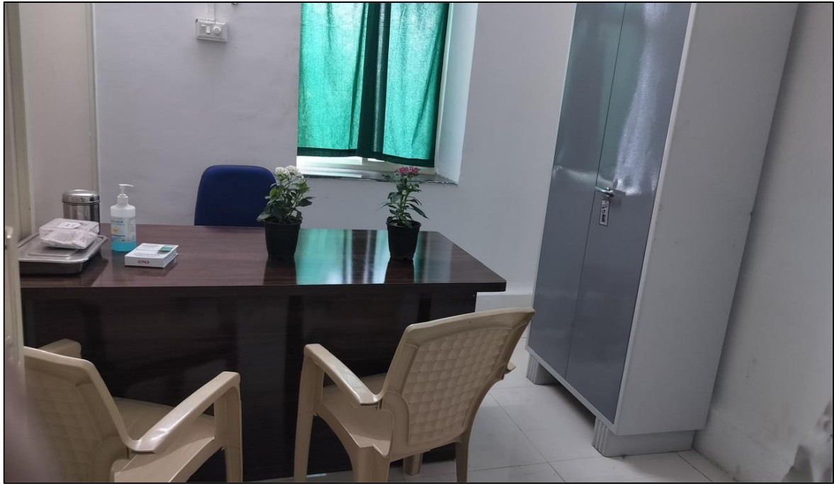
Assistant Professor cabin