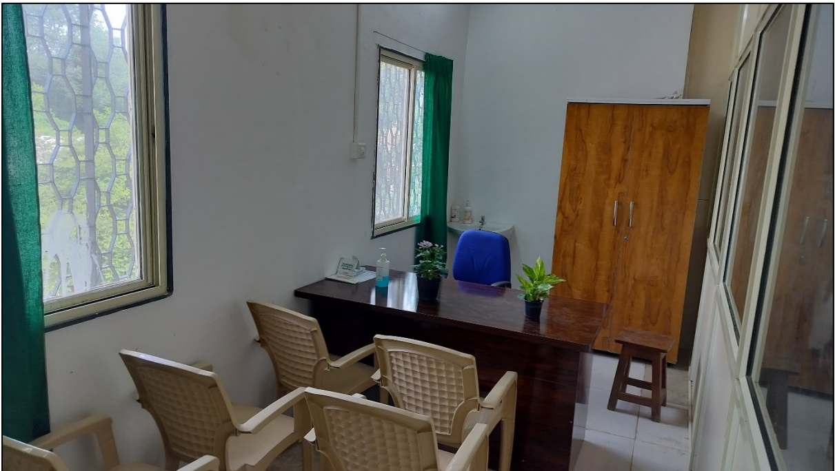
Associate Professor cabin