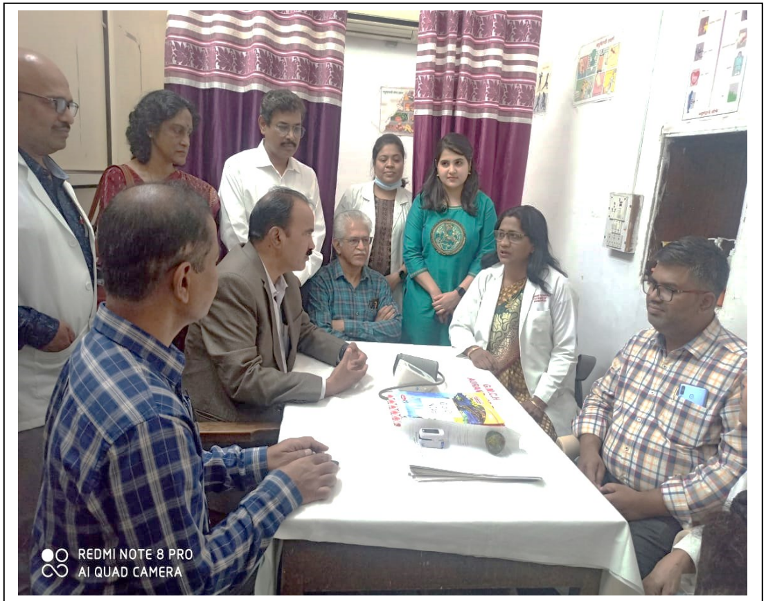
ANAESTHESIA OPD & PAIN OPD