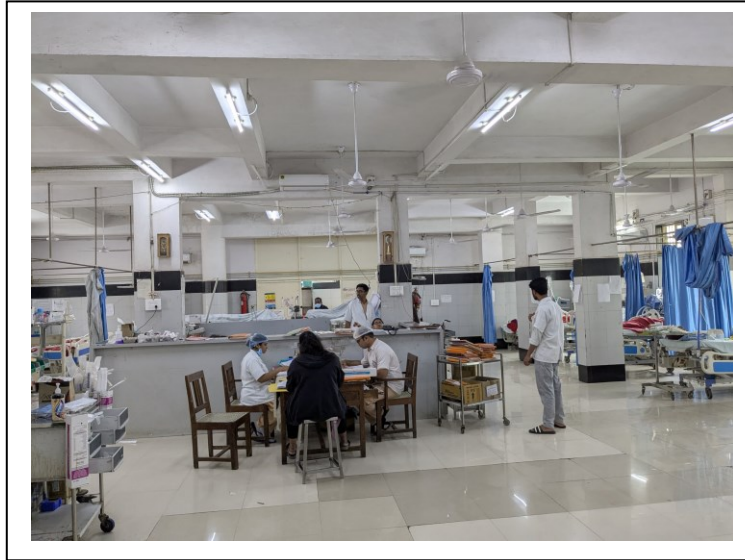
TICU / SICU