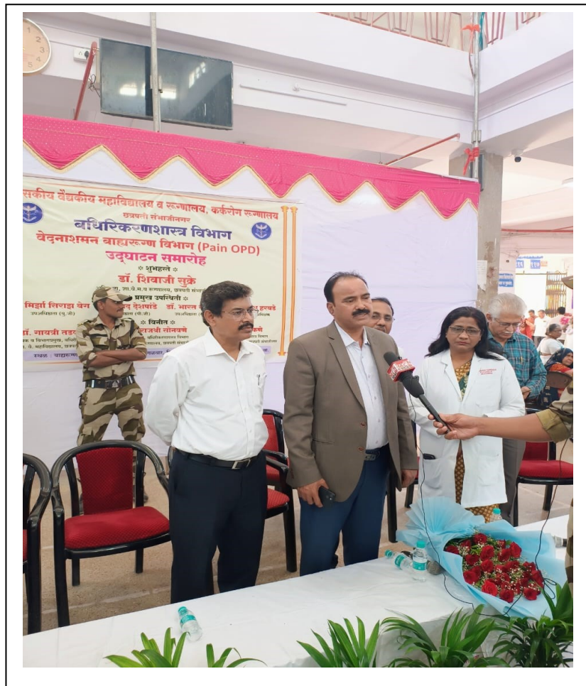
ANAESTHESIA OPD & PAIN OPD